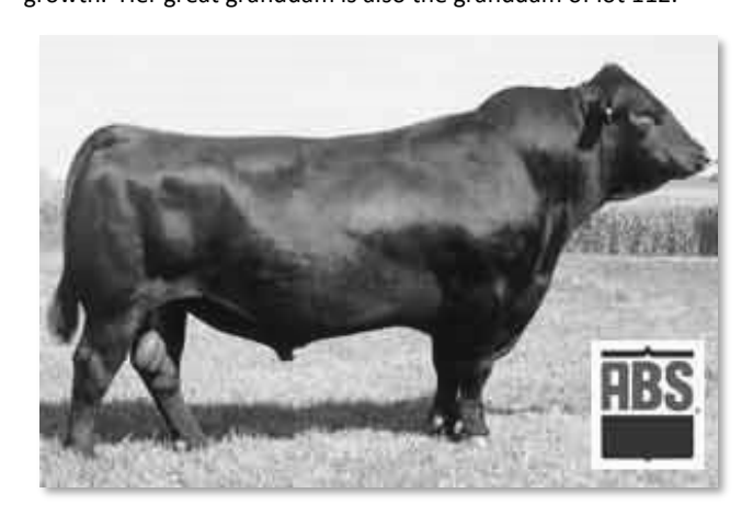
Connealy Impression, sire of lots 17, 52, 106 &113.

Impression daughters combine moderate birth with excellent growth. Her great granddam is also the granddam of lot 112.