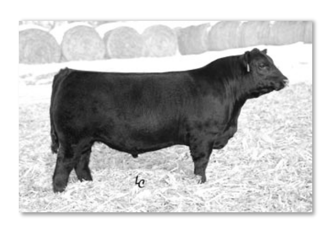
Mohnen Impressive: some of his first progeny to sell!