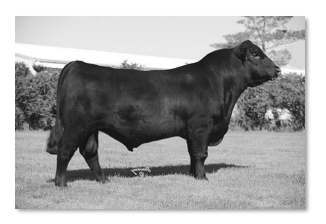
Werner War Party