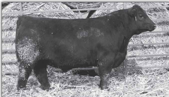
SHF GrowthFund Hickry 800 27 - Lot 27