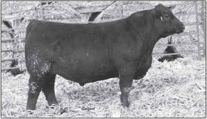
SHF Motherlode 210 4 - Lot 4

Tahoe son ratioing WWR of 113. Powerful dam by Connealy Industry and granddam by 878, still producing at 18 years old.