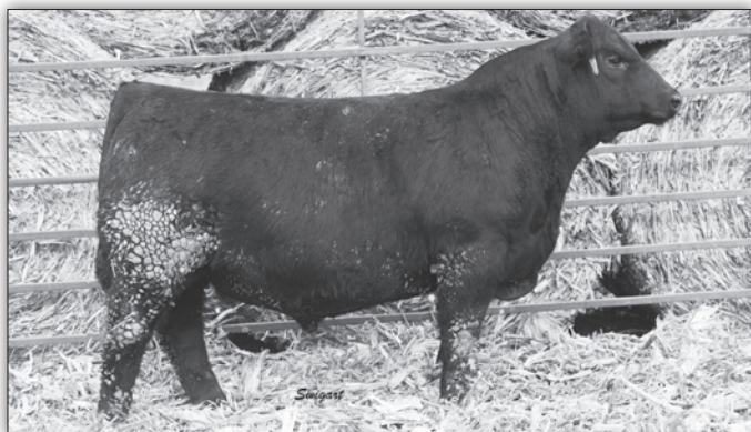
SHF Rainfall GrowthFund02728 - Lot 28

Calving-ease Growth Fund son in the top 1% genomic score for DOC. Top 15% YW, top 10% Milk and $C. Granddam produced a top-selling heifer that sold to Dan Tolley.