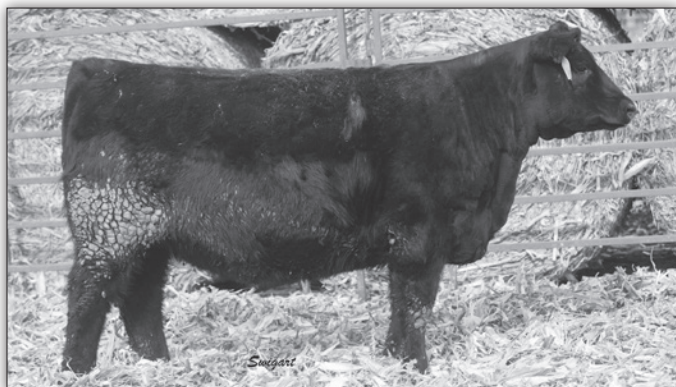
SHF SSCapital Erica16 937 12 - Lot 104

Very nice Trailblazer daughter with a WWR of 107. She is in the top 10% WN, top 5% YW, top 2% Marb, top 4% $C at +317. Genomic profile is 1% MARB and 1% DOC.