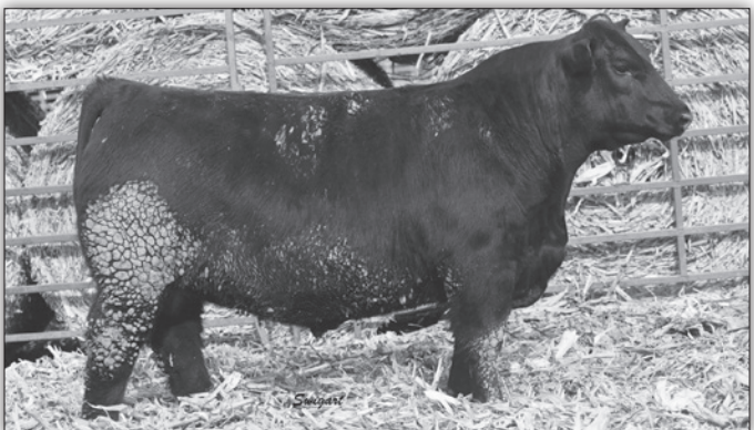
SHF Consistent Return 821 20 - Lot 20

This big-topped Wall Street son is top 2% $F, top 4% RADG and $C, top 10% YW, and top 20% RE. Dam by V A R Reserve 1111 is out of a Pathfinder CC&7 daughter.