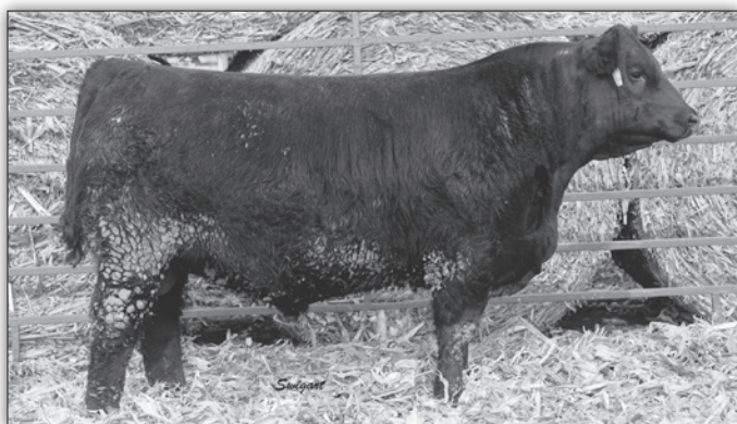
SHF KnowHow Comrad 600 41 - Lot 41

Son of SHF Visionary with a WWR of 105. With a top 4% milk EPD, his dam sells as Lot 124. Granddam was a great producer of females for us with one selling to Bob and Julie Hampton.