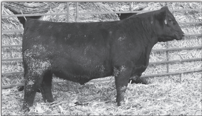
SHF Niagara Impress 101 26 - Lot 26

Calving-ease son of Hoover Know How with a maternal heritage of moderate-framed, good-producing cows.